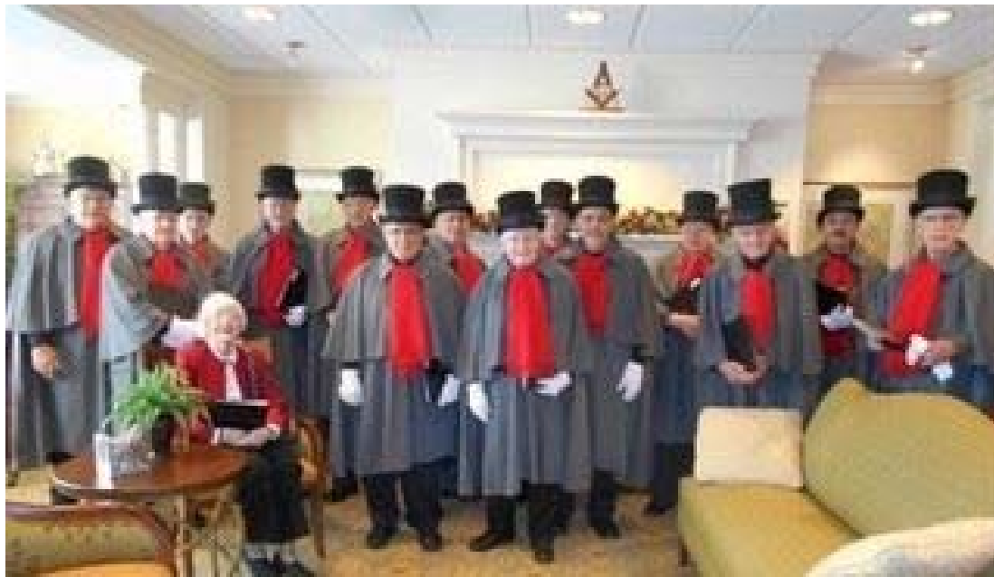
Entertainment for our Holiday Luncheon was the Gentle-Men from the Masonic Village at Elizabethtown. They are a group of about 20 men, dressed in

The program for the December Meeting was a vocal group called the Gentle-Men!