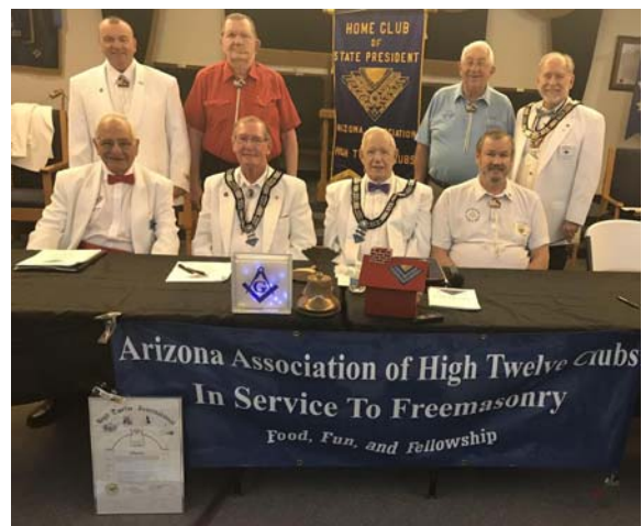
2018 - 2019 State Officer's