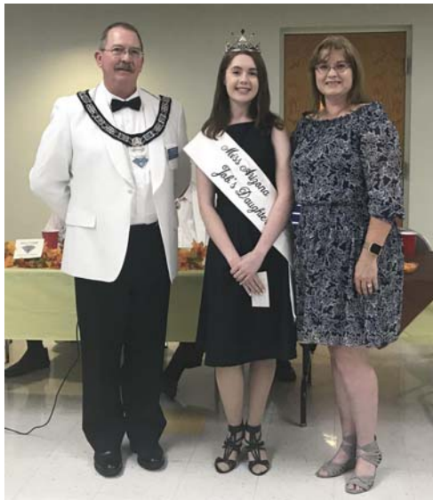
Miss AZ Job's Daughter