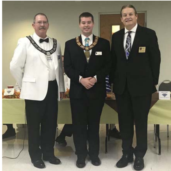
DeMolay Master Councilor