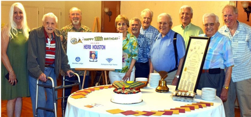
The Elks Club, Pottstown, PA